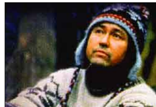
MICHIO HOSHINO (JAPAN) Photographer

Professor of the Institute for Advanced Study in Princeton, one of the greatest theoretical physicists of the 20th century, and a protégé of Albert Einstein. At the age of 24, he developed the formula which integrated the Theory of Relativity and quantum physics. Pioneered a theory to colonize space.