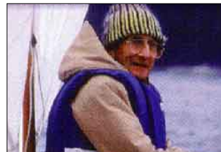
Prof. FREEMAN DYSON (USA) Physicist

Traditional navigator who successfully sailed between Tahiti and Hawaii in a traditional canoe without the aid of modern navigational equipment. His voyage brought a renewed sense of cultural pride to native Hawaiians. Also began a reforestation campaign in Hawaii to replace the large trees used for traditional canoe hulls.