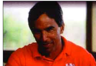
NAINOA THOMPSON (USA) Ocean Canoe Navigator

"I want children to challenge themselves and to voyage to islands they can't see."